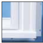
908 with sill nose

To enhance the beauty of your patio door, Harvey also offers maintenance-free vinyl exterior casing. The factory-applied casing with fusion-welded corners eliminates the need for exterior caulking and produces a clean, upscale look.